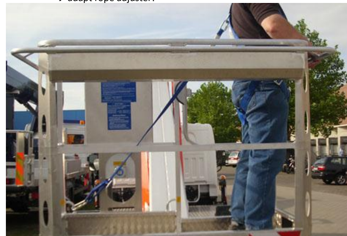
Figure 5: Caution: shortest possible securing means also during work. Maximum length of lanyard = 1.80m