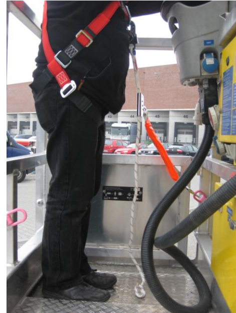
Figure 3: Securing means as short as possible when moving the work cage → adapt rope adjuster!