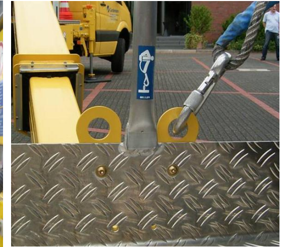
Figure 4: Always use the anchor points as specified by the manufacturer of the work platform (> 3kN). Position anchor point: Near to ground, maximum height medium rail. Never secure to the railing!