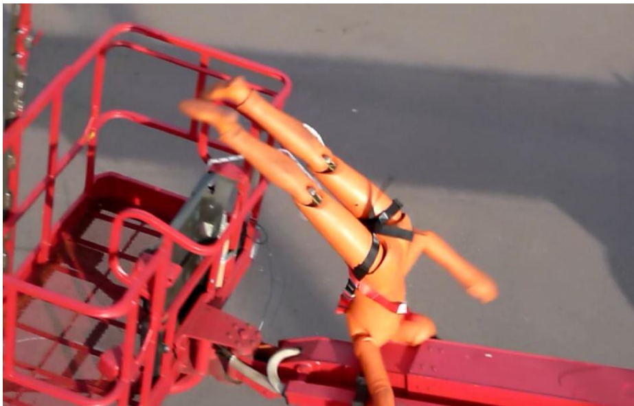
Figure 2: Fall sequence from telescopic work platform due to catapult effect (whiplash effect) and use of a lanyard which is too long → Videos under www.bauforumplus.eu/absturz

D-A-CH-S is an international group of Experts from Switzerland, Germany, Austria and South Tirol (Italy) aiming at transnational harmonization of rules and regulations on fall protection equipment at elevated workplaces.